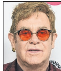
Elton... £27.5m vow