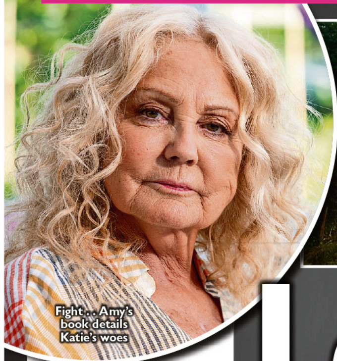
Fight... Amy's book details Katie's woes